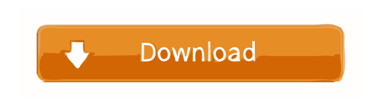
MixPad 5.25 Crack With Registration Code Full Version Download